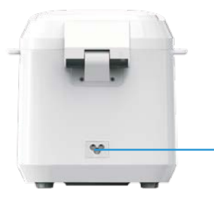
AC Power Socket