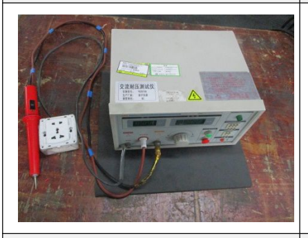
Insulation Resistance Tester